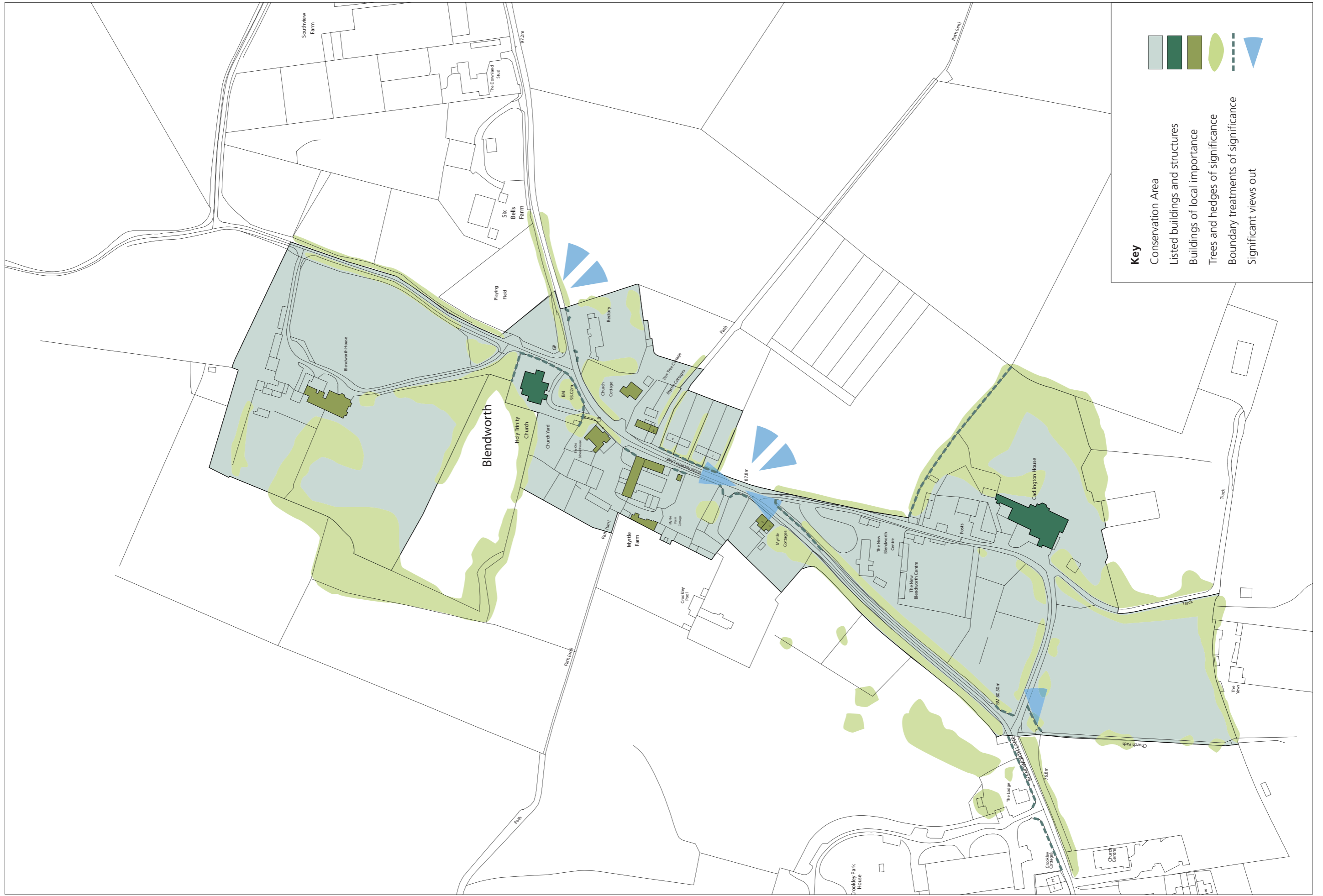
Map 2 – Character Appraisal