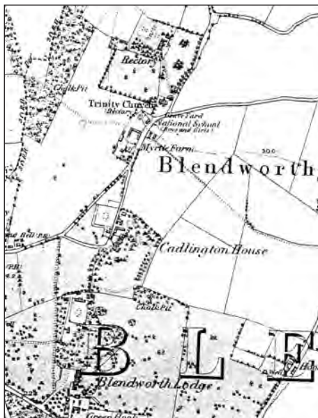
Extract from 1868-70 Ordnance Survey.

Blendworth is situated to the east of the Parish of Horndean and is a rural farming settlement, centred around Holy Trinity Church and The Old School House. The growth of the village along the lanes has formed a linear pattern of development, with the two large houses and their associated grounds of Blendworth House to the north and Cadlington House to the south.