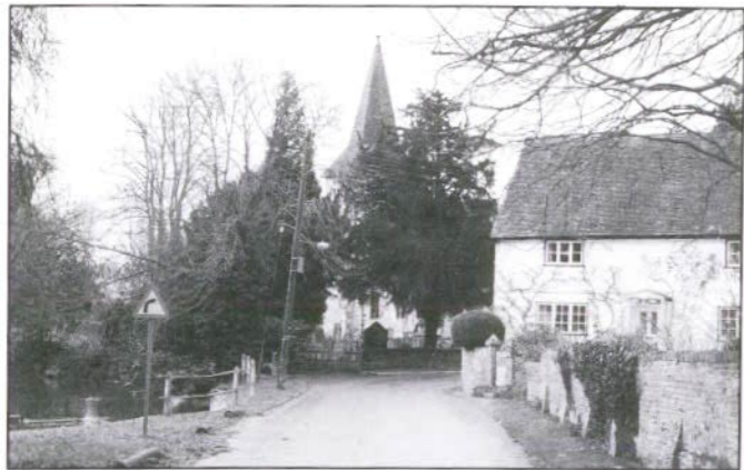
The sense of enclosure in Church Lane is created largely by hedges and the slightly rising land to the north. Views downstream from the pond are also important.

Holy Rood Church has a Norman west tower with a 19th Century Oak shingled broach spire. The Yew trees in the churchyard and the church create a focus for views from the west. Together with Church Cottage this also creates a visual 'pinch point' which then opens up by the Pond. The surrounding trees are a feature of the pond.