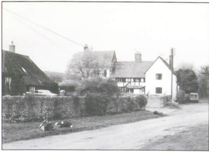
At the head of the lane is Howards Farm, a small group of farm buildings. The focal point of this group is Howards Farmhouse, a 16th Century timber framed black and white painted house. The group includes a 17th Century barn of approximately 10 bays (now converted) creates an attractive enclosed space at the junction with Church Lane and Church Road.