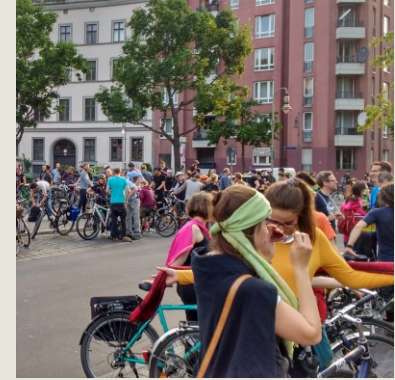
Behaviour change initiatives for example school campaigns, mass cycle rides, walking clubs, free bike hire scheme etc.