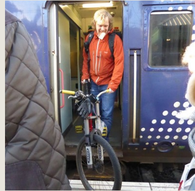
Improve the combination of cycling and train with bicycle parking, well-lit routes and collaboration with operators.