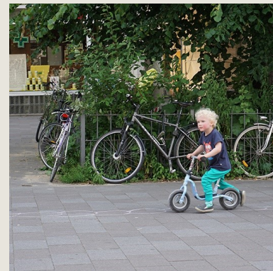
Bikeability training at all levels for cyclists and bike-awareness training for drivers.