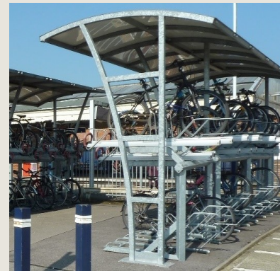
Secure, covered cycle storage is needed particularly for e-cycles at destinations such as train stations.