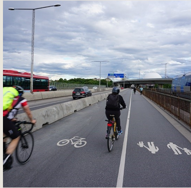
Connect routes for commuters to travel to and from work by bicycle.