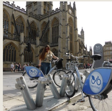
Attractive environments and routes for tourists.