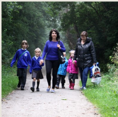
Support local walking and cycling journeys by infrastructure upgrades