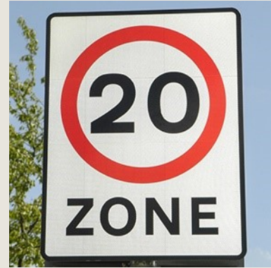
Road safety improvements, including rollout of 20mph zones in built-up areas.