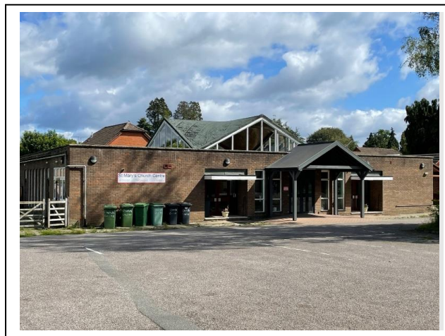
Liphook Church Centre