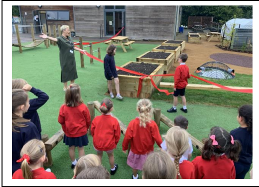
CIL funded project completed at St Mary's CE Primary School Bentworth.